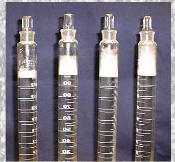
AMS Plus vs Competitors

Antifoaming agent in AMS Plus helps control foaming in the tank and is stable in high salt solutions