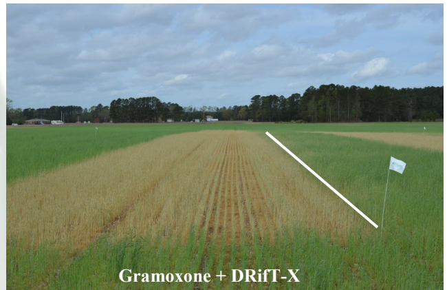
Gramoxone + DRift-X

Proper nozzle selection and operation (pressure and spray angle), good operator evaluation and decision making on wind direction, temperature inversions, application speed and susceptible crops in the area combined with DRift-X are necessary for maximum drift reduction potential.