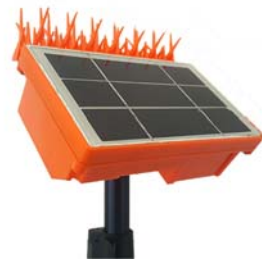
Cellular Telemetry Online Troubleshooting